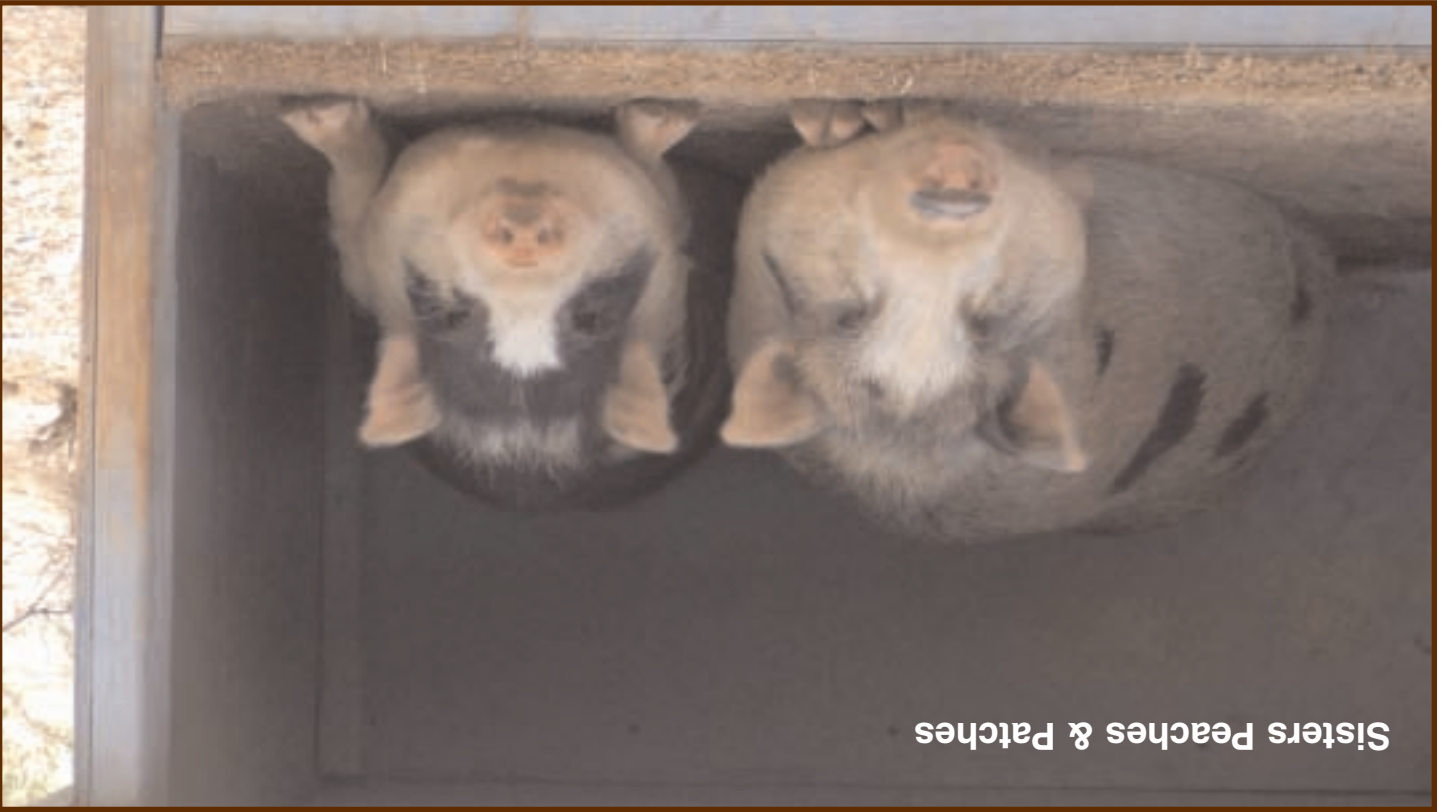
Sisters Peaches & Patches