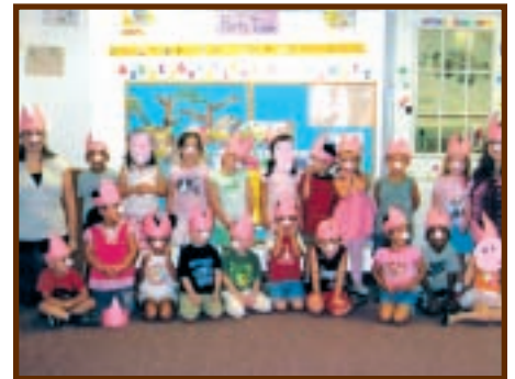
Discovery Learning Center