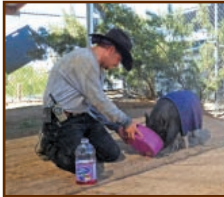
Jonny & Momma