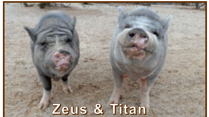
Zeus & Titan