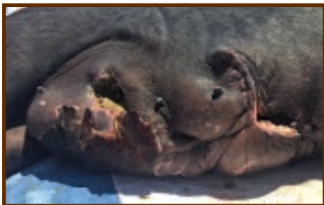
After First Surgery