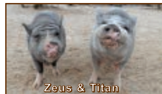
Zeus &amp; Titan