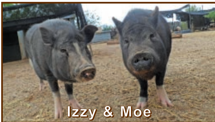
Izzy & Moe