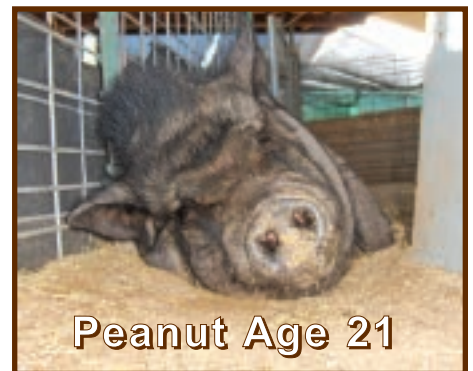
Peanut Age 21

Another common question is, "How long do pigs live?" When pot bellied pigs were first introduced to the United States as