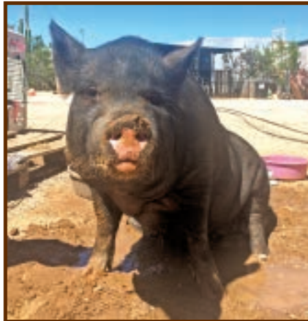
Healed and Enjoying Her Wallow

medications to put her on, which would be a lot.