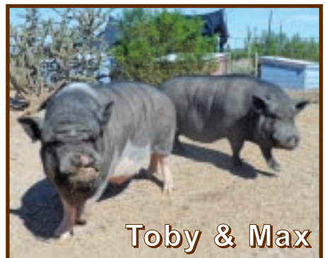
Toby & Max

were dealing with a job transfer and moving across the country. She ended up being with us for