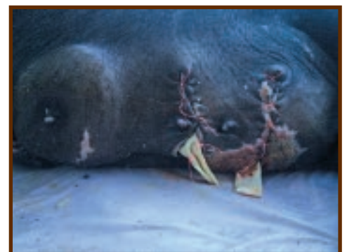
After Second Surgery

Within a couple of days Charlotte's mammary glands started expanding. Soon a weak spot opened releasing a large amount of pus. We were instructed by our vet to flush this area well and not to open up any other areas. We were also told to soak Charlotte's stomach in a diluted betadine bath. We were able to do this using a swimming pool. Charlotte was great about letting us flush her wounds and keep her clean. We kept her in our cooled barn with sheeted floors to keep her off of the dirt.