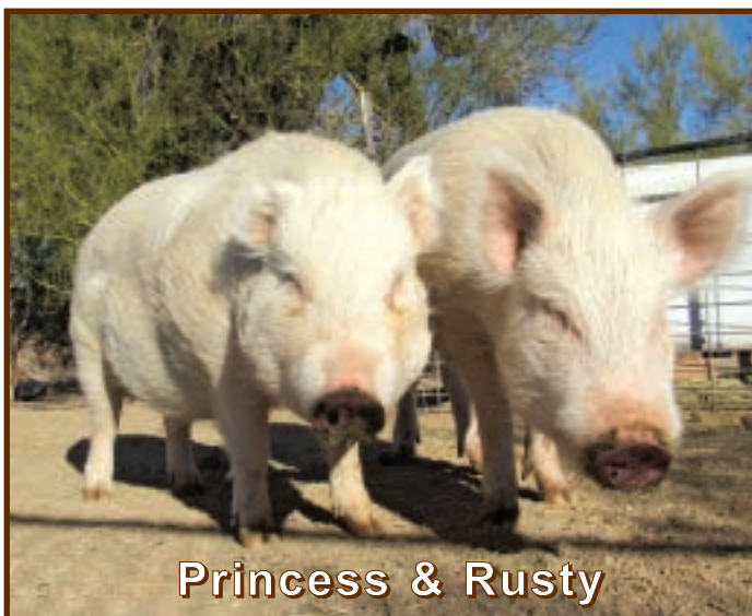
Princess & Rusty

2. Arizona residents who shop at Fry’s Food Stores, a chain of supermarkets located in Arizona, can go to www.frysfood.com to register your V.I.P. card in Fry’s Community Rewards program. When asked to find your organization, type in Ironwood Pig Sanctuary. It will be under the parent organization, the Mary C Schanz Foundation. Each time you check out at Fry’s simply scan your V.I.P. card and a percentage of your purchases will be donated to the sanctuary quarterly. Remember...you must re-enroll each year to continue earning rewards for Ironwood.