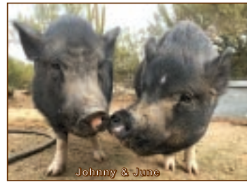
Page 16 IRONWOOD PIG SANCTUARY Issue 81

J ohnny and June came to Ironwood from the Humane Society in 2008 when they were babies.