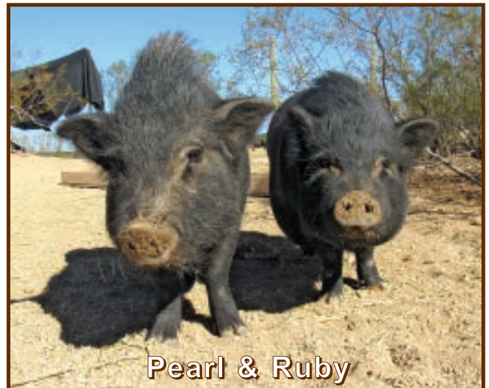
Pearl & Ruby

1. Go to www.smile.amazon.com and sign in the same as you would for your Amazon account. When prompted to pick your charity, simply type in “Ironwood Pig Sanctuary” in the search bar. It will appear as the Mary C Schanz Foundation which is the parent organization and is doing business as (dba) the Ironwood Pig Sanctuary. Each time you go to Amazon it will automatically open under AmazonSmile. The sanctuary will receive a donation of 0.5% from Amazon for ALL your purchases, not just those made from Ironwood’s Wish List.