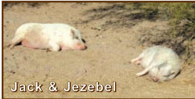
Jack & Jezebel

herd hangs out together during their relaxation time. They have a community shelter that they share