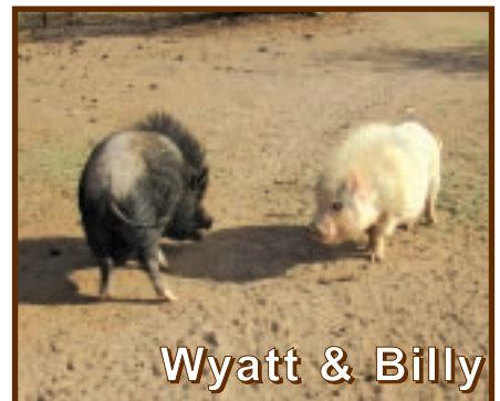
Wyatt & Billy

Pigs fight. It's just what they do and how they determine their