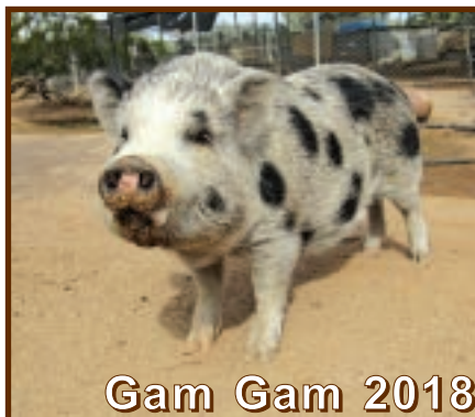
Gam Gam 2018

Each time we lose another elderly pig, I have to remind myself that it opens the door for another youngster in need. Saying