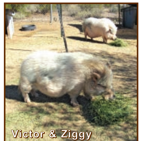
Victor & Ziggy

North Field's space being used to make large enclosures for elderly pigs who are not quite ready to go to the more intense special care areas but do need a smaller environment without competition from large numbers of younger pigs. Bradley and George retired from the North herd and live in one of those homes along with