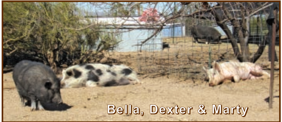
Bella, Dexter & Marty

the Northwest Field. Victor and Ziggy moved in next door to them last year when their field was needed for Eleanor and Henry (see their story in the January 2018 issue). The boys were the only two left of the Phase 6 herd and didn't need such a large area any longer. They are happy sharing the smaller space. Another corner section of the field was recently enclosed for a family of elderly pigs that had been living at one of Ironwood's foster homes for the past 11 years. The time had come for Miss Bliss, Little Miss Bliss, Flag and Shyanne to move to the sanctuary's main facility where they could receive