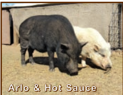
Arlo & Hot Sauce

When the sanctuary began filling its first field with pigs nearly 17 years ago, we found that the pigs' varied needs required separate living spaces. The large six acre field was soon subdivided into different fields to accommodate