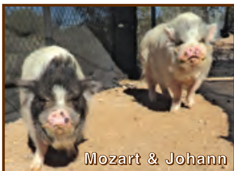
Mozart &amp; Johann

Mozart and Johann are brothers whose owners let them run loose