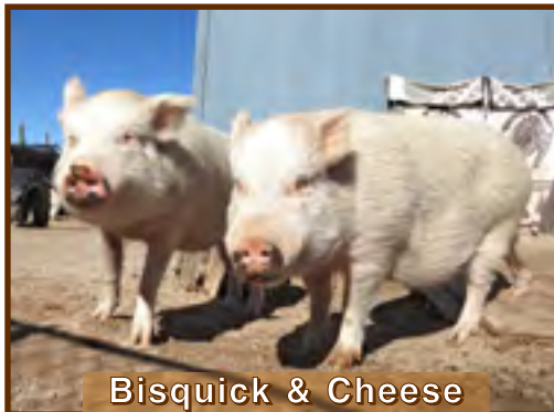
Bisquick &amp; Cheese

pen in the backyard but needed more space. Igor, Ivan, and Blossom's human was serving a long-term jail sentence and his friend got tired of caring for them. Java and Kava lived at a small rescue having financial difficulties and came here to ease the burden. When one owner's water well went dry, we took in 12 pigs including two pairs of