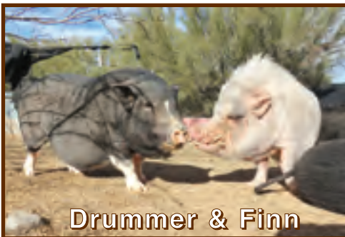
Drummer & Finn

result in injury. A handsome boy named Shakey was the main concern. He has severe neurological problems causing him to be unstable, often falling down and having difficulty walking in a straight line. He needed to be in a small field with only a few pigs that would not be apt to fight with him. Around the same time Shakey arrived, a youngster named Christopher came. He had bad lameness due to abnormal narrowing of his spinal column. Finn, Drummer and Miley each came from a different field/herd where they