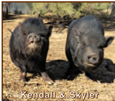
Kendall & Skyler

Christopher and Cookie are no longer with us, but the remainder of the little herd is still going strong and have become good friends. Others have joined the group in pairs over the years. In early 2021, sisters Kendall and Skyler moved into Shakey's.