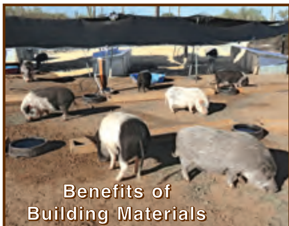
Benefits of Building Materials

There are gift cards listed in the newsletter's Wish List that are always welcome donations. The Walmart and Fry's gift cards can