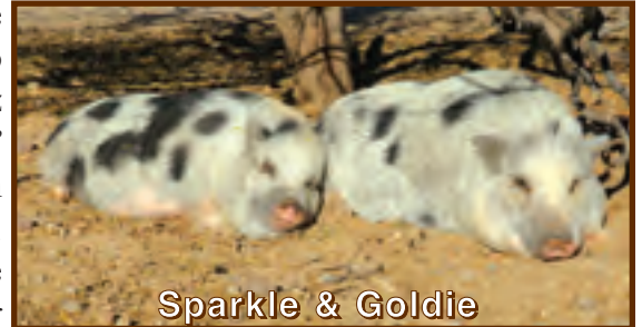
Sparkle & Goldie

their area. It varies a great deal within counties, towns, and neighborhood HOAs. One situation in the fall of 2018 involved a breeder in northern