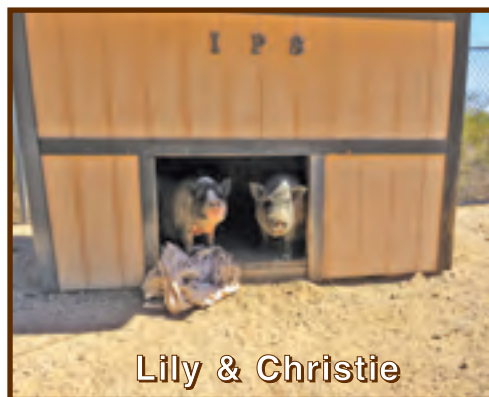
Lily & Christie

Sometimes supporters make arrangements to drop off large item donations at the sanctuary. We are always happy to see a pickup truck loaded with rolls of carpet pull up in the driveway. We use a lot of carpet especially during the winter. All the shelters have the doorways covered with carpet to keep out the cold air. The floors are carpeted as well. The pigs that are fed in the individual pens with special meals have a carpet "placemat" to keep the pigs from tipping their bowls over into the