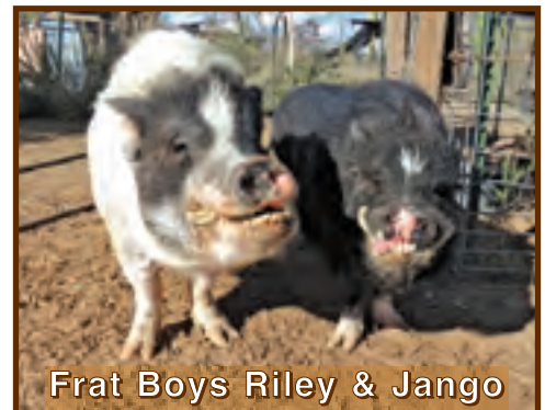
Frat Boys Riley &amp; Jango

born here shortly after their mom, Charlotte, was taken from a hoarding situation.