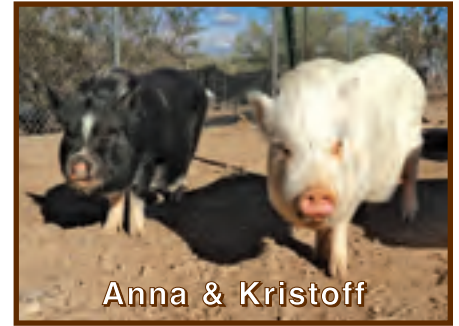
Anna &amp; Kristoff

We have never done any breeding at Ironwood (and never will!), but we have rescued pregnant females who gave birth to their babies here. There have been 6 such births during the past decade. Tabitha's babies Clark, Dudley, and Caroline are 7-year-olds living in Lil' East Field. In that same herd are Ruby's children Jelly Bean, Carlton, Londyn, and Sharona who are almost 8 years old. Those "kids" share the same territory as Crystal's daughters Billie Jean and Ivy. Crystal's sons Captain and Merlo were adopted as youngsters, but returned to us in 2019 when their human moved to Alaska. The boys live in Comanche's Field. Jezebel's babies Jameson, Violet, and Mona will soon be 9 years old. Two of Elsa's litter were adopted, but the others; Sven, Kristoff, Anna, and Yelena, live in Amy's Yard. Huratio, Riley, Ed, and Jango, otherwise known as the Frat Boys, will celebrate their tenth birthday next month. They were