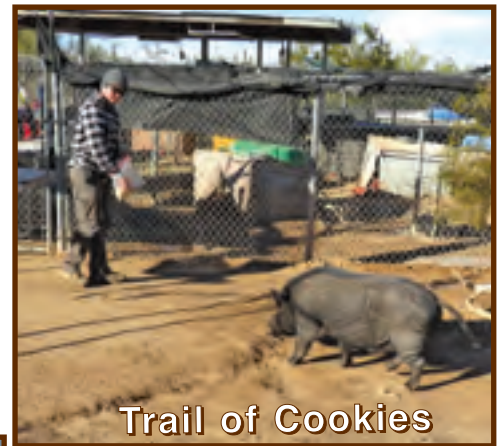
Trail of Cookies

are still working our way through a huge back stock of them, but we also use fig newtons. These are the next step in the med delivery system when the sandwich doesn't work. Some pigs are adept at eating a peanut butter sandwich, swallowing it then spitting out the pills. It's really amazing they can do that but also annoying. That's when that gooey fig newton comes in handy. We can poke a few pills inside the cookie and most pigs can't resist the yumminess and eat the whole thing, pills and all. Lucky Lucy gets both a sandwich with Biotin powder and a fig newton with her pills inside.