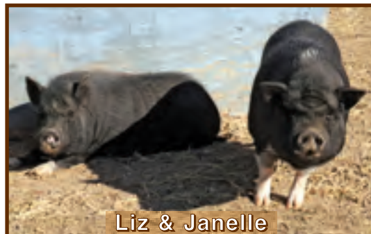
Liz & Janelle

recovering, we went back and got the 7 males to be neutered. The man promptly ghosted us once all the pigs were in our hands and they became permanent residents except for one mom and daughter who were adopted. Sisters Liz and Janelle living in Lil' East Field with their mom Miriam, are best friends. It's always so sweet to see the girls cuddling with their mother after all these years. One of their brothers, Dennis, also lives in that field, but he is always