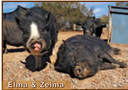
Elma &amp; Zelma

Some of the groups of siblings were strays rescued from various situations. Jubilee and Jitterbug, sister and brother, were originally picked up by Pima Animal Control Center before making