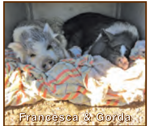
Francesca & Gorda

Ginger has impaired proprioception due to narrowing between her shoulder blades that pinches her spinal cord. She gets around and enjoys exploring her field but needs to rest more often than usual. Denise is in great health but came along to keep Ginger company. The last pair to join the herd in the summer of 2022 was