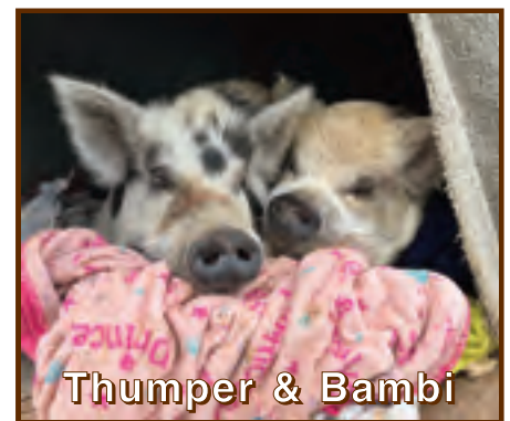
Thumper & Bambi

Another item on the Wish List year-round is blankets, blankets, and more blankets. This winter we nearly ran short on blankets. The pigs had enough in their houses but just barely. Rainy days made for a mad scramble to get wet blankets that the pigs had drug out into the fields hung up to hopefully dry by the end of the day. Then we rushed about stuffing them back into the shelters for the cold nights. Pigs love to nest, snuggle, or bury