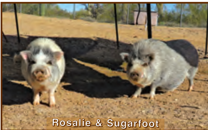
Rosalie &amp; Sugarfoot

White, from a breeder in Tucson. This man said he bought a different breed of animal each year and let them have babies so his children could experience the birthing process. When he was “done” with the pigs, he planned to send them to auction where they would most likely have ended up as food or breeding stock. We’ve no idea what happened to the female but at least these 3 are safely living in the Far East Field where they have made friends with others in their herd. Sully and Stitch have remained close during their years here. A teenage breeder who got bored with his “business,” was the source of sisters Sugarfoot and Rosalie who live in the Princess Field. Another owner let her pigs breed, not as a source of money, but simply due to negligence in having them altered. After she was evicted from a rental home, we took in Chardonnay and her two litters. Harpo, Zeppo, Dante,